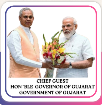
CHIEF GUEST HON'BLE GOVERNOR OF GUJARAT GOVERNMENT OF GUJARAT

ICAR-INDIAN INSTITUTE OF FARMING SYSTEMS RESEARCH, MEERUT